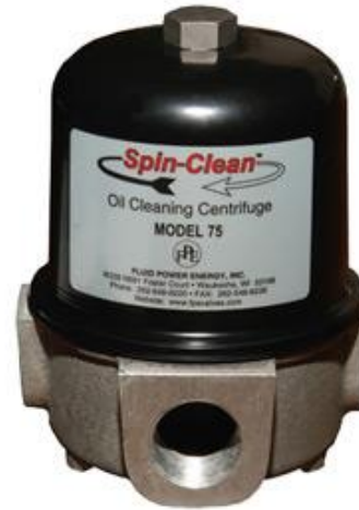
Model 75 & 75-1

The lube oil cleaning Centrifuge removes the solids from the engine oil using centrifugal force, a force of 1000 "G's", or 1000 times the force of gravity. These solids are stored inside of the rotating turbine bowl, which will hold more than 10 times the solids of your engines full-flow filters. The act of exposing the oil to 1000 "G's" is what results in micron removal less than one. Once the particles have been removed the clean oil is then returned to the oil pan.