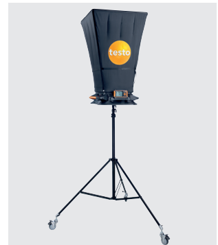
Sturdy, wheeled tripod (optional) for large jobs or sites with high installed outlets. Convenient hands free 420 hood operation with Bluetooth connectivity.