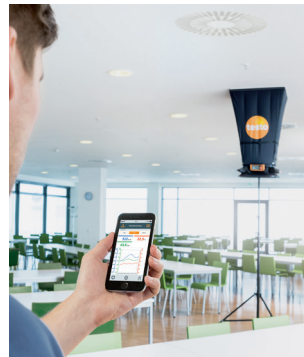
Testo 420 Bluetooth App allows for Smart, hands-free operation. Display and create custom reports on mobile devices. Send reports via email from the job site.