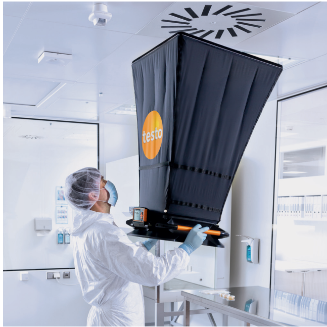
Precision measurements for critical applications