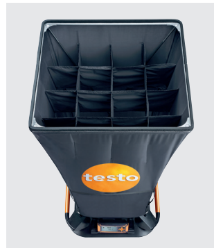
Patented flow straighteners are standard in all 420 flow hood sizes and configurations.