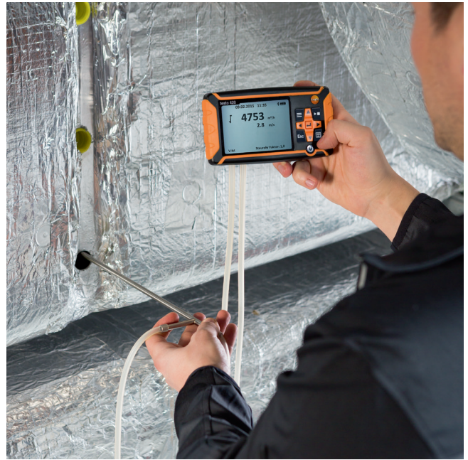
Detachable Differential Pressure (t420) instrument allows Pitot tube measurements in ducts (Pitot tube optional)